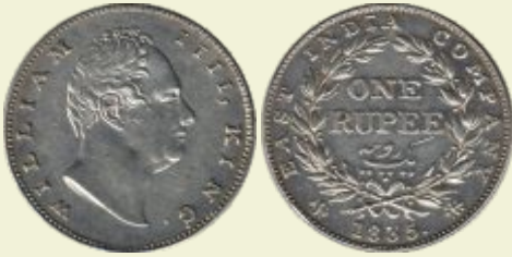
214 William IV, Silver, Rupee , Bombay Mint, 1835, no initials, B / II (ii) (Pridmore# 40, GK# 33). Extremely Fine, Partial cleaned.