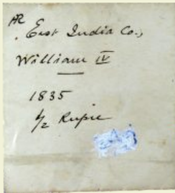
216 William IV, Silver ½ Rupee , Bombay mint, 1835, no initials, A / I (ii), two leaves above 'F' of HALF away from branch (Pridmore# 72, GK# 50). Ex S.M.Shukla Collection with Original envelope, Fine, Rare.