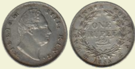
213 William IV, Silver, Rupee , Calcutta Mint, 1835, F incused, A / I (Pridmore# 36, GK# 16). About Extremely Fine.