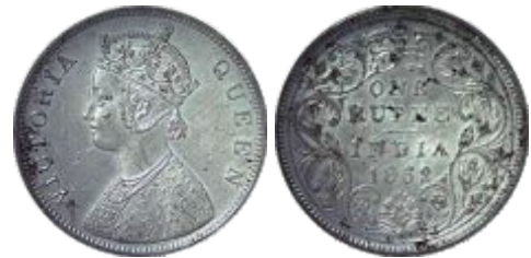
219 Victoria Queen, Silver, Rupee , Calcutta Mint, 1862, B / II / 0 / 0, embroidery with incuse effect (Pridmore# 55, GK#242). Certified by NGS as AMS 55, Scarce.