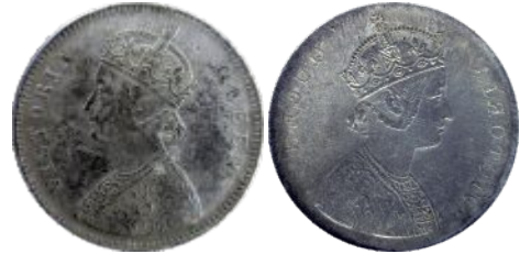
218 Victoria Queen, Silver, Rupee , 1862-1876, obverse Brockage (lakh). Very Fine, Very Rare.