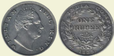
215 William IV, Silver, Rupee , Bombay Mint, 1835, no initials, B / II (ii) (Pridmore# 40, GK# 33). Very Fine.