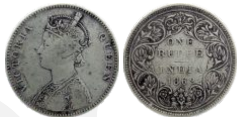
221 Victoria Queen, Silver, Rupee , Bombay Mint, 1862, A / II / 1 / 7, top dot within the tip of top flower (Pridmore# 91, GK# 334). About Very Fine, Extremely Rare.