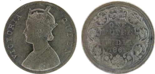
220 Victoria Queen, Silver, Rupee , Bombay Mint, 1862, B / II / 1 / 0, obverse crude style lettering (Pridmore# 69, GK# 286). Extremely Fine, Extremely Rare.