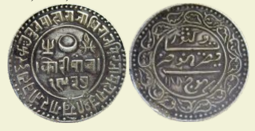
122 Khengarji III, Silver, 5 Koris, with name of Victoria Empress, VS 1937, AD 1881, Bhuj mint; with the Bars on either side of denomination on obv, Leaves in the wreath on rev is Clockwise, the weak Unit figure 1 of 1881 in the AD year appears to be 188 and the dot in the Urdu legend makes it read as 1880 and not 1881 (Rajgor# 206.6). About Extremely Fine, Rare