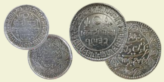
118 Pragmalji II, Silver (2), Set of 2: 5 Koris, VS 1932, AD 1875; and 2 1/2 Koris, VS 1932, AD 1975, Bhujnagar mint, with the name of Queen Victoria. About Extremely Fine, Rare. 2 coins