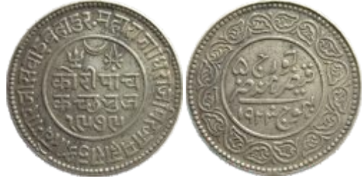
126 Khengarji III, Silver, 5 Koris, with the name of George V, VS 1979, AD 1923, Bhuj mint (Rajgor# 233.33). About Extremely Fine, Rare.