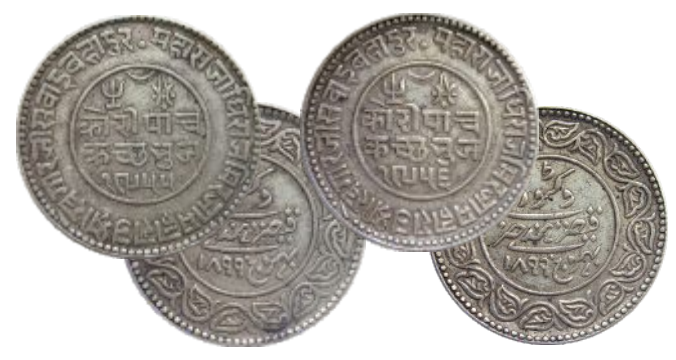
123 Khengarji III, Silver (2), 5 Koris, with name of Victoria Empress, VS 1955, AD 1899, and VS 1956, AD 1899, Bhuj mint (Rajgor# 209.1, 209.2). About Extremely Fine, Scarce. 2 coins