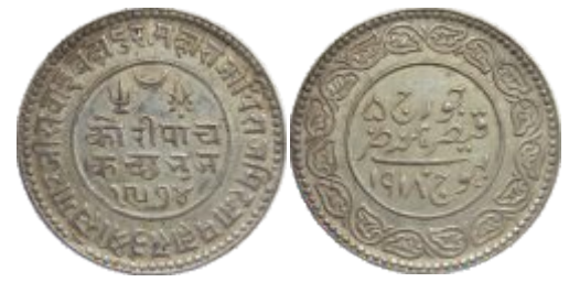
124 Khengarji III, Silver, 5 Koris, with the name of George V, VS 1974, AD 1918, Bhuj mint (Rajgor# 233.16). About UNC, Rare.