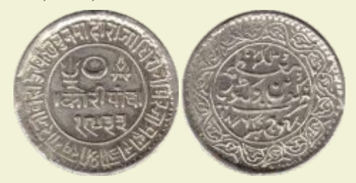
121 Khengarji III, Silver, 5 Koris, with name of Queen Victoria, VS 1933, AD 1876, Bhujnagar mint, Milled edge (Rajgor# 191.1). The Very First issue of Khengarji III.Extremely Fine+, Rare.