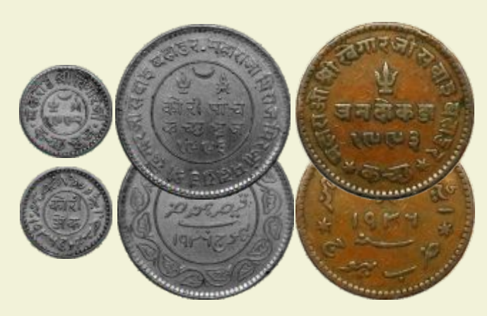
157 Khengarji III , with the name of Edward VIII , Set of 3 Denominations : 5 Koris, 1993, 1936, 1 Kori, 1992, 1936, and 3 Dokda, 1993, 1936, Bhuj mint. Very Fine to Extremely Fine, Rare as a set of 3.