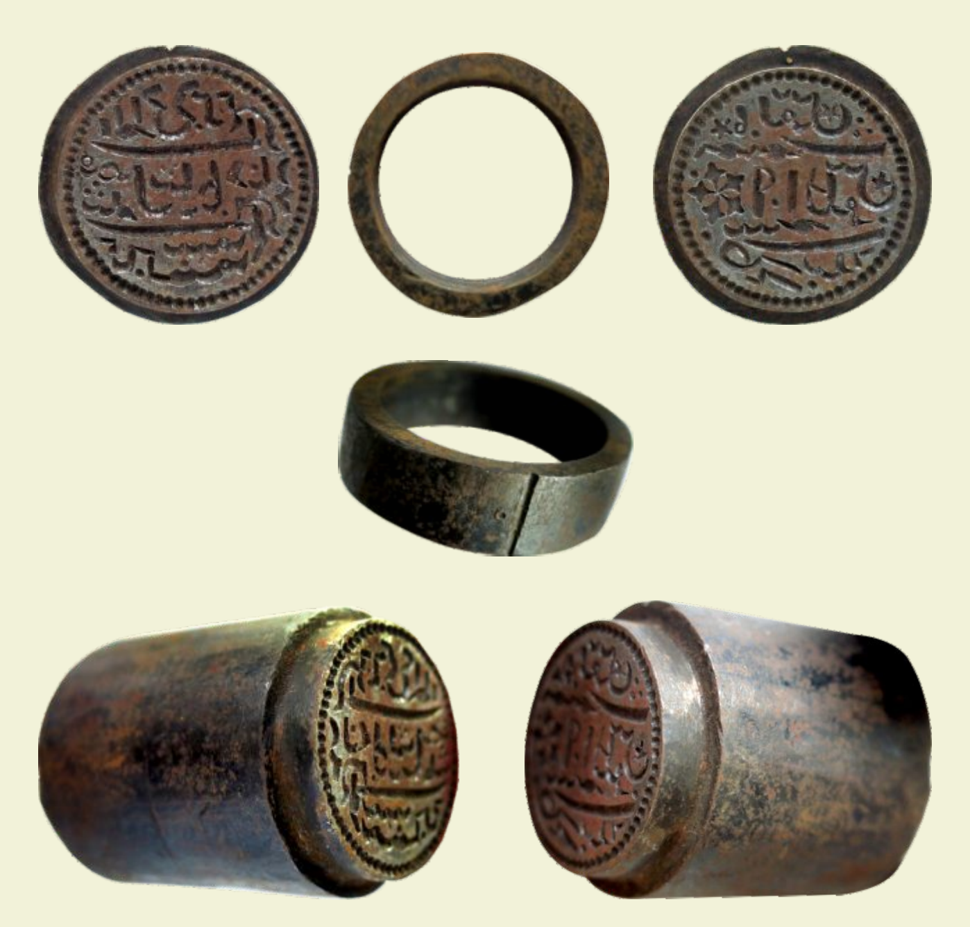
179 A Pair of Murshidabad Rupee Coin Token Dies with Collar Ring, Bronze (3), mint name Murshidabad but the coin designs are of Calcutta mint, in the name of Shah Alam II. Pair of Anvil Die (obverse), and Punch Die (Reverse) of the famous Murshidabad Tokens with the Collar Ring for making the coins with the Plain Edge. Almost New, Very Rare to find a complete pair of such tokens with the Collar Ring which is known for the first time here, making it easy to understand the minting process of the British India coins. 3 pieces.