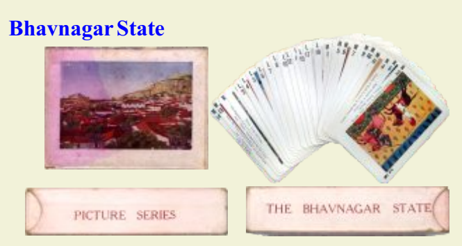
126 Royal Playing Cards Set of all 38 Colour Battlefield Cards, the Playing Card Set was made by the Maharaja of Bhavnagar for the Guests attending a Royal marriage. The card contains War Scenes from the Frescos of the Old Darbar Gadh of Killeh Sihore, and illustrates war scenes of Capture of Chital (1793), Battle of Tana (1794), and Battle of Patna (1796). The set contains manual of the card game consisting of 4 ways of playing the cards, namely, Not At Home, Brag, Army Spoof, and Donkey. The Card Game also contains manual of the all the three Wars. Unused, with gold gilding. Rare.