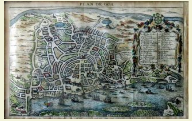
142 Map of Goa, Lithograph Map, early 19<sup>th</sup> century AD, 185 x 130 mm, the colourful map of Goa, called PLAN DE GOA is an interesting piece of Goan History as it depicts the then city plan of Goa. The Map also lists as many as 29 places in the map in Portuguese language. The map is mounted in a glass frame. Extremely Fine+, Very Rare.