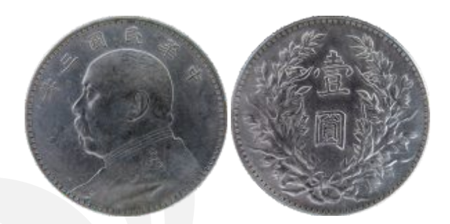
159 China, Silver, Fatmah Dollar, bust of the ruler to left on obv, Chinese language within a wreath on rev. About Extremely Fine, Scarce.