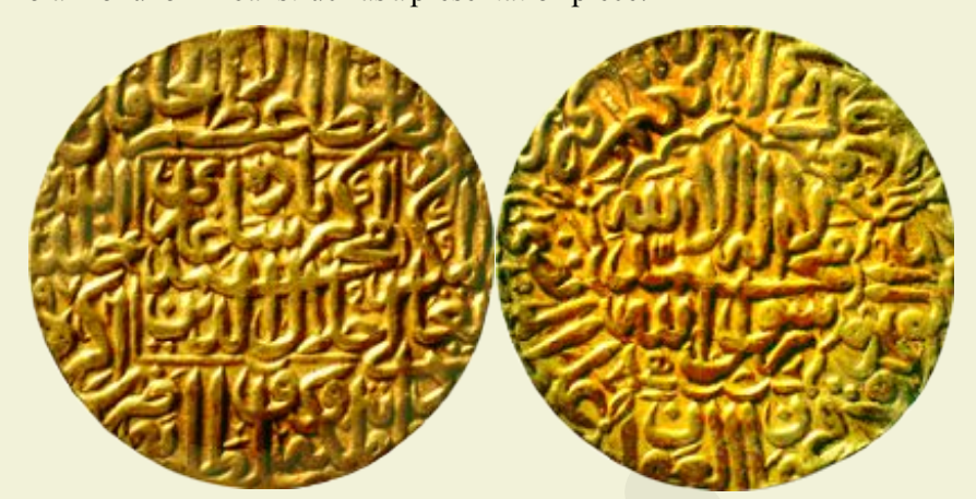
Akbar, Nazarana 5 Mohurs, Agra Mint

The following is a 5 Tola Mohur of Akbar struck as a presentation piece: