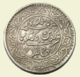
326 Khengarji III, Silver, 5 Koris , with the name of Queen Victoria, VS 1933, AD 1876, Bhujnagar mint (DR# 191.1). About Extremely Fine, the first issue of Khengarji III, Scarce.