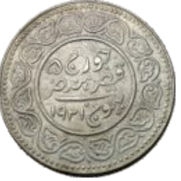
330 Khengarji III, Silver, 14.04 g, 5 Koris , with the name of George V, VS 1973 , AD 1921 , Date Error, Bhuj mint, milled edge without Security edge (DR# 233.14a). Almost UNC, Very Rare .