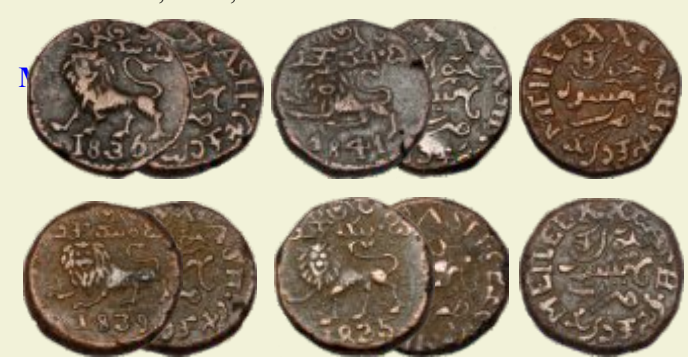
169 Copper (7), XX (20) Cash , various years, 1835, 1836, 1838, 1839, 1840, 1841, and 1844. Very Fine to About Extremely Fine, Scarce. 7 coins