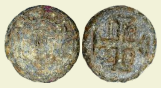
178 Diu, Lead, 20 Bazarucos , Cross with date in corners, crowned arms on rev, 1823 . About Very Fine, Scarce .