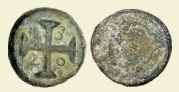
181 Diu, Lead, 38.60 g, 40 Bazarucos , Cross with date in corners, crowned arms on rev, 1820 , the denomination is not listed in KM. Extremely Fine, Very Rare .