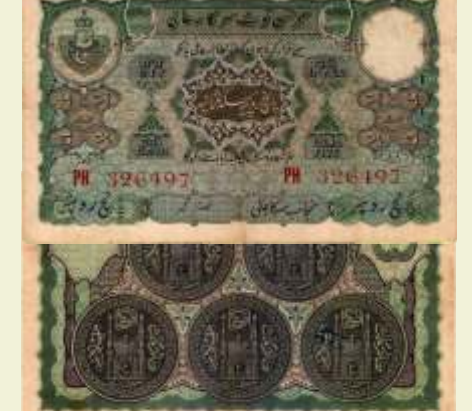
खजाना दिकाना नवलगढ