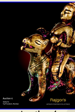
Auction 4 18/4/2013 Mumbai