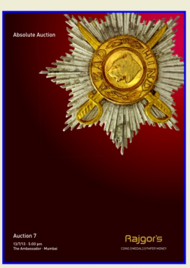
Auction 7 13/7/2013 Mumbai