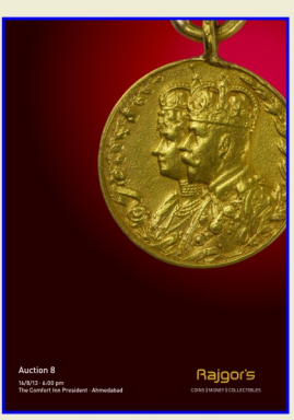
Auction 8 16/8/2013 Ahmedabad