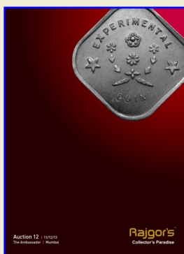
Auction 12 11/12/2013 Mumbai