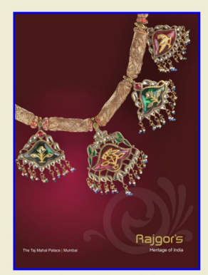
Auction 10 29/9/2013 Mumbai