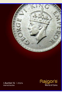
i-Auction 14 27/2/2014 Mumbai