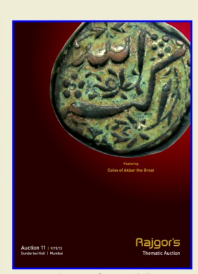
Auction 11 9/11/2013 Mumbai