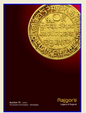
Auction 15 6/3/2014 Ahmedabad