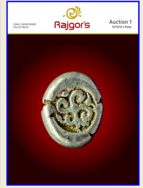
Auction 1 12/12/2012 Pune