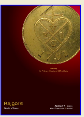
Auction 9 31/8/2013 Mumbai