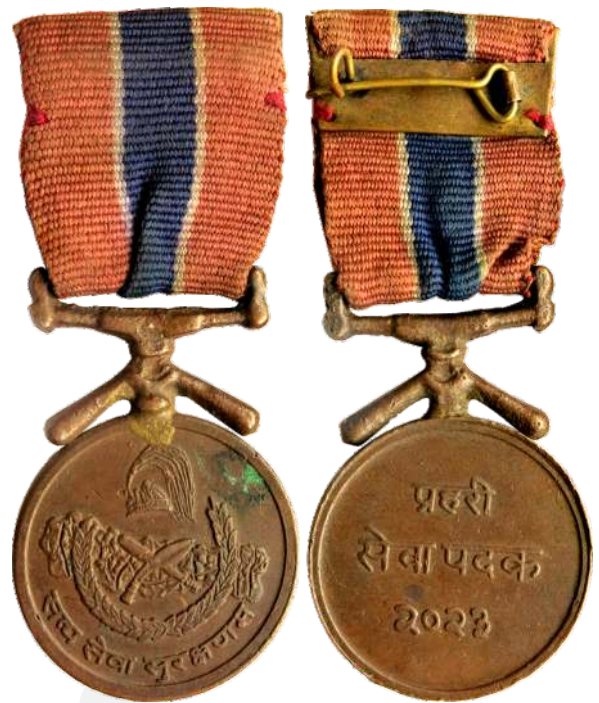
342 Nepal , Bronze, Military Service Medal , Arms of the country in the centre and motto at the bottom on obv, Prahari Sewa Padak VS 2023 (AD 1966) on the reverse. A ribbon at top. Very Fine, Rare.