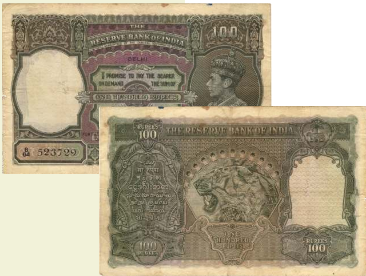
345 George VI, 100 Rupees , Signed by C.D. Deshmukh , DELHI Circle of Issue, Side Profile Watermark, Serial Numbers in Black, B64 Prefix (Jh-Rz# 4.72D). Very Fine+, Very Rare.