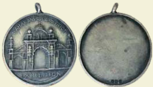
343 Saharanpur Medal , Silver, an ornate gate way of the city of Saharanpur in UP in the centre and legend at top and bottom reads, SAHARANPUR DISTRICT / EXHIBITION on obv. Hallmark and blank reverse. A suspender at top. Unnamed, About Extremely Fine, Scarce.