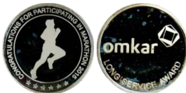
344 Mumbai Marathon Medal , Silver, 25 g, a marathoner sunning to right on obv, legend around CONGRATULATIONS FOR PARTICIAPTING IN MARATHON 2015 and 6 stars at the bottom on obv; name of the manufacture OMKAR at the centre and at bottom LONG SERVICE AWARD on rev. Mint State.