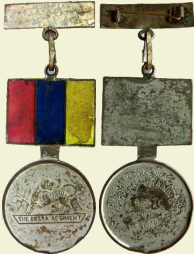
340 Dogra Regiment Medal , Silver plated Copper, roaring tiger to left and looking behind, below in the ribbon and printed ribbon below the suspender and medal at the bottom; engraved on the reverse, the Dogra Regiment Centre, Recruits Centre/ best in vent. Very Fine+, Rare.