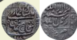
75 Shah Shuja (23 rd June 1616 to 7 th February 1661, AH 1068-1070), Silver, 11.20 g, 21.02 mm, Rupee, Patna Mint , with the mint name partly visible in the left margin on rev, (AH 1068, RY Ahad), (KM# 276.1). Persian legend on the obverse reads, Kalima Shahada inscription La ilaha ila Allah, Muhammadar Rasul Allah with dotted motifs and leaf designs within the square, four khalifas name in margin around; the Persian legend on the reverse reads, shah shuja muhammadi badshah ghazi in square & abul zafar nasr ud din muhammad saheb-e- qiran sani , regnal year ahad . Very Fine+ with traces of original red mud deposits still seen on the edge, one of the top-most rarities in Mughal Numismatics as this is only the Fifth known specimen seem to have been offered in the last 15 years. A recent sale coin of the ruler was sold for about 10 Lakhs of Rupees!!!

When Shah Jahan fell ill in September 1657, a struggle for the throne started between his four sons - Dara Shikoh, Shah Shuja, Aurangzeb and Murad Baksh. Shuja immediately crowned himself the emperor and took imperial titles, November 1657. In his second attempt to win Delhi, the first being against his brother Dara Shikoh and later against Aurangzeb, Shuja marched again to the capital. A battle took place on 5 th January 1659 at the Battle of Khajwa (Fatehpur district, Uttar Pradesh) where Shuja was defeated. After his defeat, Shuja retreated towards Bengal. He was pursued by the imperial army under Mir Jumla. Shuja put up a good fight against them. However, he was finally defeated in the last battle in April 1660. After each defeat he had to face desertions in his own army, but he did not lose heart. He, rather, re-organised the army with renewed vigor. But when he was going to be surrounded at Tandah, and when he found that reorganization of the army was no longer possible, he decided to leave Bengal for good and take shelter in Arakan. After an unhappy few years in Arakan, his last days were spent in Tripura and Manipur.