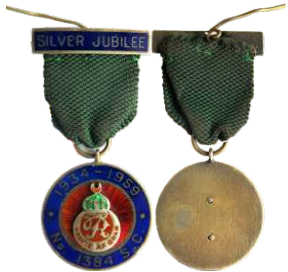
341 Rampur State , Silver and enamel, Silver Jubilee Medal of the State, 1934-1959, with a Minar and inisial R in the centre, No. 1384 S.C. With a Ribbon at the top and the clasp reading SILVER JUBILEE. Extremely Fine, Rare.