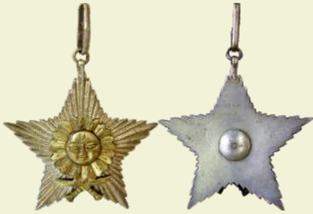
339 Indore State , Silver, Indore Star Medal , Sun Face symbol of the State within a Star in the centre. A suspender and a ring at top. Un-named. Brilliant UNC, Rare.