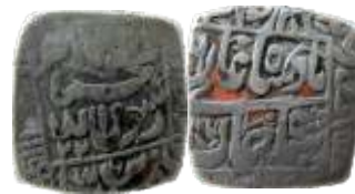
74 Shah Jahan , Silver, 11.06 g, Square Rupee, Multan mint , square area type, RY 22 (KM# 236.2). Very Fine+, Rare in square shape.