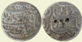
73 Nur Jahan jointly with Emperor Jahangir, Silver, Rupee, Surat mint , AH 1035 (KM# 168.6). Very Fine, Rare.