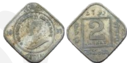
284 George V, Cupro-nickel, 2 Annas , Calcutta mint, 1933, no dot . About Very Fine.