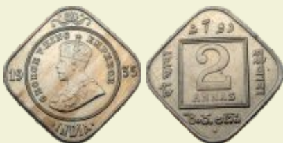
285 George V, Cupro-nickel, 2 Annas , Bombay mint, 1935 , dot . Almost UNC.