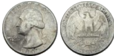
324 USA, Silver, ¼ Dollar, 1942. About Extremely Fine.