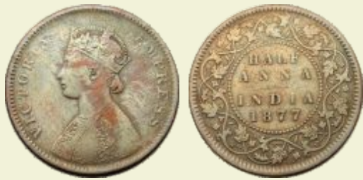
238 Victoria Empress, Copper, 1/2 Anna, Calcutta mint, 1877, Bust C . About Very Fine (cleaned).