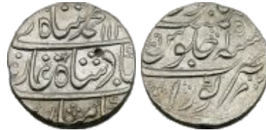
124 Muhammad Shah, Silver, Rupee, Kora mint, complete mint name at bottom on rev, RY 15. Extremely Fine.