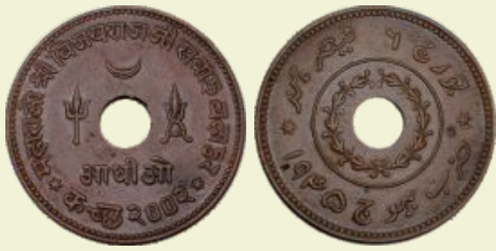
170 Vijayrajji, Copper, Adhiyo, with the name of George VI, VS 2002, AD 1945, Bhuj mint. Extremely Fine+ Estimate: ₹ 1-100