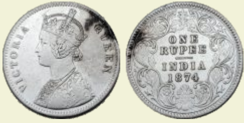
225 Victoria Queen, Silver, Rupee , Calcutta mint, 1874, A1 / I / no mm . Ex. mount, Very Fine (cleaned).