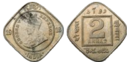
283 George V, Cupro-nickel, 2 Annas , Bombay mint, 1918, dot . Almost UNC.