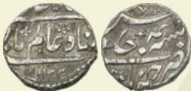
121 Shah Alam I, Silver, Rupee, Chinapatan mint, mint name at bottom on rev, AH 1122, RY 4. Very Fine+