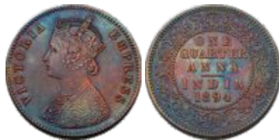
246 Victoria Empress, Copper, 1/4 Anna, Calcutta mint, 1894, B/II . UNC, beautiful toning, Rare.