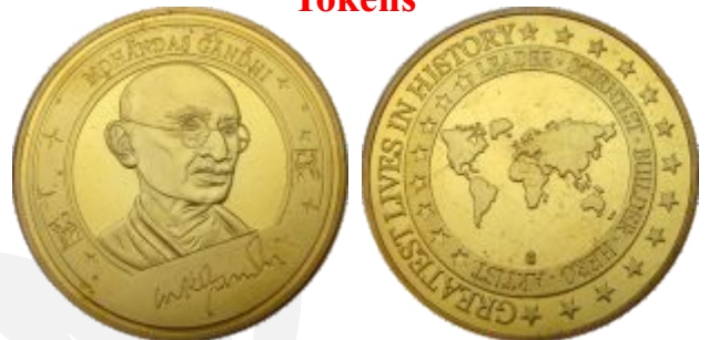
326 Mahatma Gandhi Token, autographed bust of Gandhji on obv, issued in the series, Greatest Lives in History. UNC in plastic case.