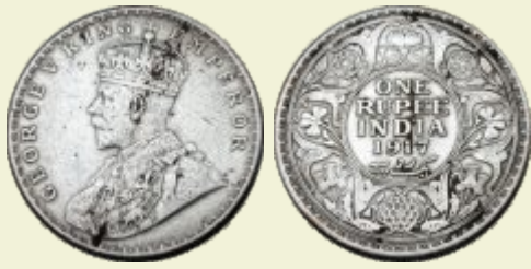
273 George V, Silver, Rupee , Bombay mint, 1917, dot . Very Fine (cleaned).