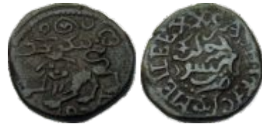
179 Krishnaraja Wodeyar, Copper, 20 (XX) Cash, lion walking to left on obv, value on rev. Very Fine.