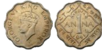
302 George VI, Cupro-nickel, 1 Anna , Calcutta mint, 1941, no dot, head type II , UNC.