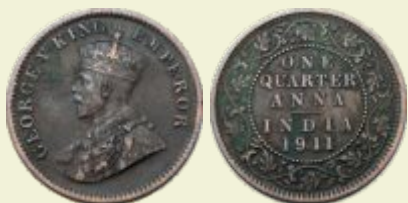
289 George V, Copper, 1/4 Anna , Calcutta mint, 1911 , no dot , Pig type . Green patina on reverse otherwise About Extremely Fine.