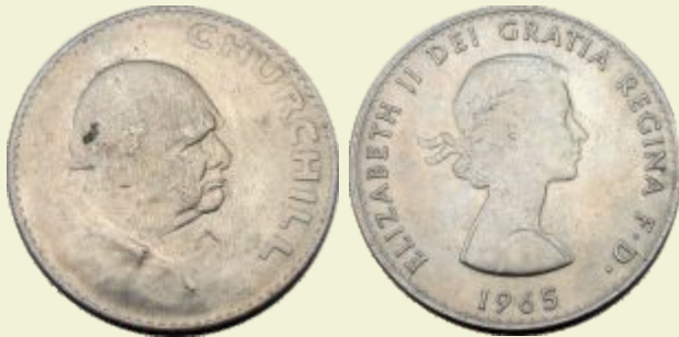
320 United Kingdom, Elizabeth, Cupro-Nickel, Crown, 1965, bust of the Queen to right on obv, bust of Churchill on rev. About Extremely Fine.