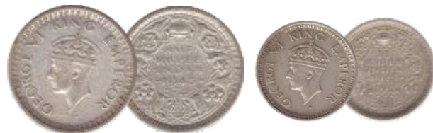
91 George VI, Silver, Rupee , 1/2 Rupee , 1/4 Rupee , Bombay mint, 1943 . About Very Fine to Very Fine+, 3 coins.