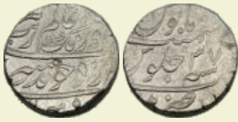
116 Aurangzeb, Silver, Rupee, Patna mint, mint name at bottom on rev, AH 1104, RY 37. Extremely Fine+.