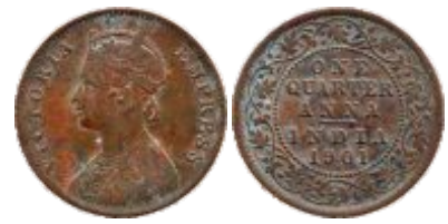
248 Victoria Empress, Copper, 1/4 Anna, Calcutta mint, 1901, B/II . Graded by NGS as VF 35.