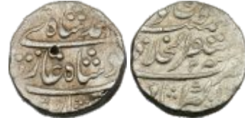
123 Muhammad Shah, Silver, Rupee, Akbarabad Mustaqir ul Khilfat (Agra) mint, complete mint name at bottom and epithet in the centre on rev, RY 2. About Extremely Fine.