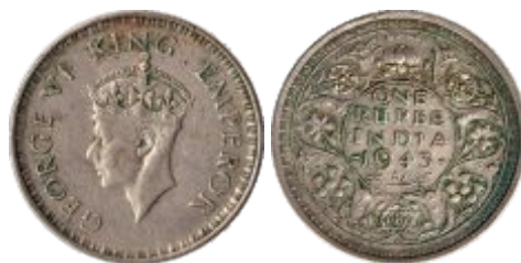
293 George VI, Silver, Rupee , Bombay mint, 1943 , large head , small '3' . Very Fine+ (cleaned).