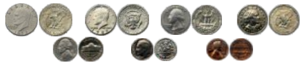
325 USA, Miniature Coins (7), Cupro-Nickel and Copper, assorted lot of various denominations and years. Almost UNC. 7 coins