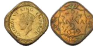
303 George VI, Nickel-Brass, 1/2 Anna , Bombay mint, 1942, no dots by INDIA & dashes by year . Almost UNC, Rare.