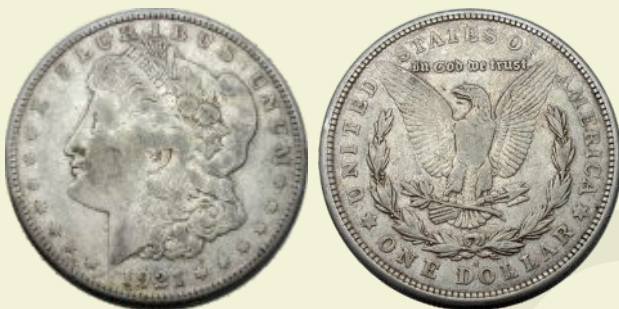
321 USA, Silver, Morgan Dollar, 1921, bust of Liberty to left on obv, eagle on rev. Very Fine.