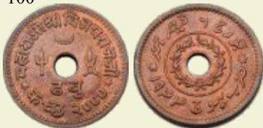
173 Vijayrajji, Copper, Dhabu, with the name of George VI, VS 2000, AD 1944, Bhuj mint. Extremely Fine+ Estimate: ₹ 1-100