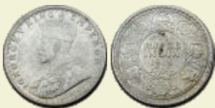
277 George V, Silver, \frac{1}{4} Rupee , Calcutta mint, 1918, no dot . About UNC.