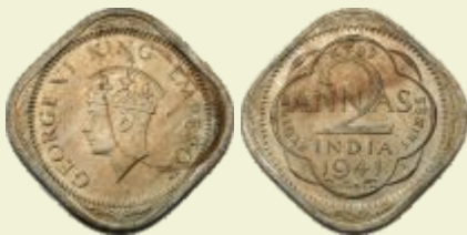
299 George VI, Cupro-nickel, 2 Annas , Calcutta mint, 1941, no dots by year, head type II , About UNC.