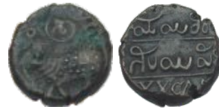
178 Krishnaraja Wodeyar, Copper, 20 (XX) Cash, elephant walking to left on obv, value on rev. Very Fine.