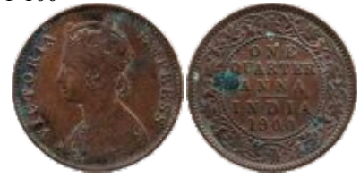
247 Victoria Empress, Copper, 1/4 Anna, Calcutta mint, 1900, B/II . Graded by NGS as XF 45.