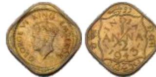
304 George VI, Nickel-Brass, 1/2 Anna , Calcutta mint, 1943, dots by INDIA & dashes by year . Extremely Fine.