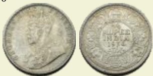
278 George V, Silver, \frac{1}{4} Rupee , Bombay mint, 1936, dot . About Extremely Fine.