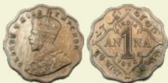
288 George V, Cupro-nickel, 1 Anna , Bombay mint, 1936 , dot , Almost UNC.