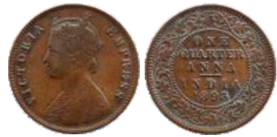
244 Victoria Empress, Copper, 1/4 Anna, Calcutta mint, 1893, B/II . Graded by NGS as XF 40.