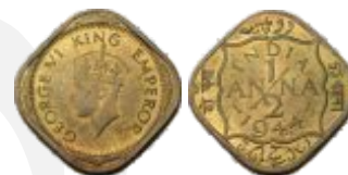
306 George VI, Nickel-Brass, 1/2 Anna , Calcutta mint, 1944, dots by INDIA & dashes by year, die flaw on obverse . About UNC.