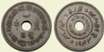
172 Vijayrajji, Copper, Dhabu, with the name of George VI, VS 1999, AD 1943, Bhuj mint. Extremely Fine+ Estimate: ₹ 1-100