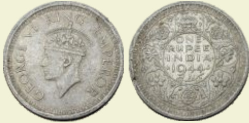
296 George VI, Silver, Rupee , Bombay mint, 1944, D / I (a) / L raised . Very Fine+.