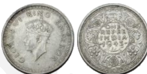
294 George VI, Silver, Rupee , Bombay mint, 1943 , B (a) / I (a) / diamond , small '3' . Very Fine.