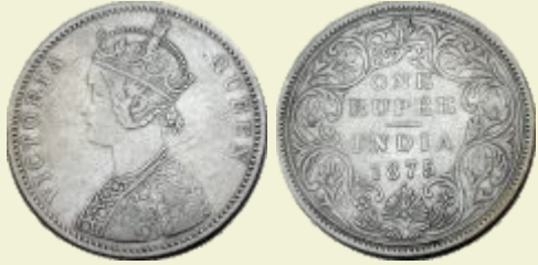
227 Victoria Queen, Silver, Rupee , Bombay Mint, 1875, A2 / II / dot . Very Fine (cleaned).