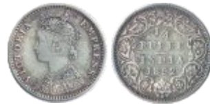
234 Victoria Empress, Silver, ¼ Rupee , Bombay Mint, 1892, C / I / B incused . Very Fine+, Scarce.