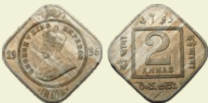
287 George V, Cupro-nickel, 2 Annas , Calcutta mint, 1936 , no dot . About UNC.