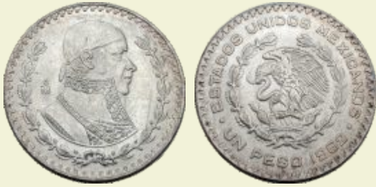
318 Mexico, Silver, Peso, 1962, portrait on obv, flying eagle and value on rev. Extremely Fine+ Estimate: ₹ 1-100