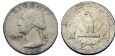
323 USA, Silver, ¼ Dollar, 1964. About Extremely Fine.