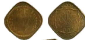
305 George VI, Nickel-Brass, 1/2 Anna (24) , Calcutta mint, 1944, dots by INDIA & dashes by year, Packed in brown paper roll . All UNC, 24 coins.