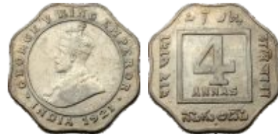
281 George V, Cupro-nickel, 4 Annas , Bombay mint, 1921, dot . About Very Fine, Scarce.