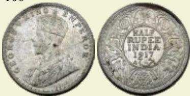
275 George V, Silver, \frac{1}{2} Rupee , Bombay mint, 1917, dot . UNC with original mint luster, Scarce.