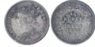
232 Victoria Empress, Silver, ¼ Rupee , Bombay Mint, 1887, C / II / B raised . About Extremely Fine.