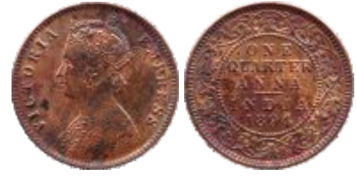
245 Victoria Empress, Copper, 1/4 Anna, Calcutta mint, 1894, B/II . Graded by NGS as MS 60 Prime Details (stained).