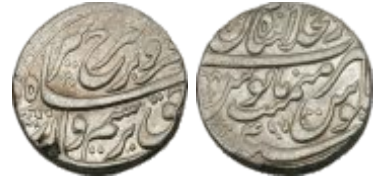
122 Farrukhsiyar, Silver, Rupee, Shahjahanabad Dar ul Khilfat mint, mint name at top on rev, RY 4. Extremely Fine+.