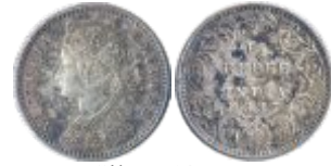
231 Victoria Empress, Silver, ¼ Rupee , Bombay Mint, 1887, C / II / B raised . Extremely Fine, Scarce.