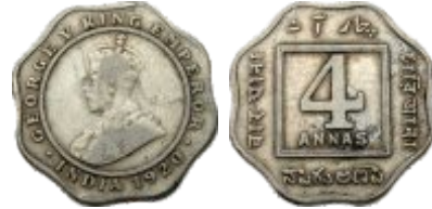
280 George V, Cupro-nickel, 4 Annas , Calcutta mint, 1920, no dot . Fine+, Scarce.