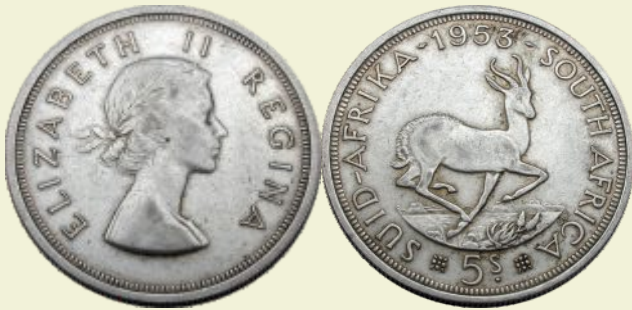
319 South Africa, Elizabeth II, Cupro-Nickel, 5 Shillings, 1953, portrait and antelop type. Very Fine+