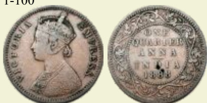
242 Victoria Empress, Copper, 1/4 Anna, Bombay mint, 1888, B/I . Very Fine. Scarce.