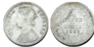
233 Victoria Empress, Silver, ¼ Rupee , Bombay Mint, 1889, C / II / B incused . About Very Fine (cleaned).