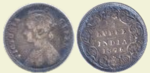
229 Victoria Queen, Silver, 2 Annas , Calcutta mint, 1876, A / I . Very Fine.