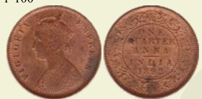
243 Victoria Empress, Copper, 1/4 Anna, Calcutta mint, 1892, B/II . About UNC.