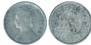
235 Victoria Empress, Silver, ¼ Rupee , Bombay Mint, 1892, C / I / B incused . Very Fine, Scarce.