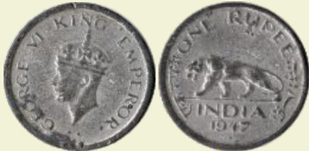
297 George VI, Lead, Rupee , 9.33g, Security Edge, Contemporary Copy , About Very Fine Details, Scarce.