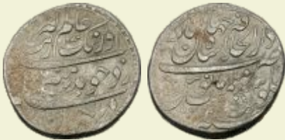
118 Aurangzeb, Silver, Rupee, Shahjahanabad Dar ul Khilfat mint, complete mint name at top on rev, AH 1080, RY 12. Very Fine.