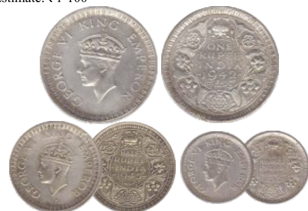
292 George VI, Silver, Rupee , 1/2 Rupee , 1/4 Rupee , BM 1942 , BM 1945 & CM 1942 . Very Fine to Extremely Fine, 3 coins.