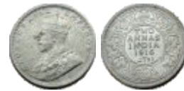
282 George V, Silver, 2 Annas , Calcutta mint, 1916, no dot, planchet flaw on obverse . Extremely Fine+.