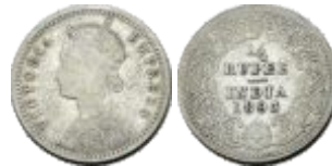
236 Victoria Empress, Silver, ¼ Rupee , Calcutta Mint, 1893, C / II / C incused . About Very Fine (cleaned).