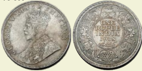
274 George V, Silver, Rupee , Bombay mint, 1918, dot . Extremely Fine.