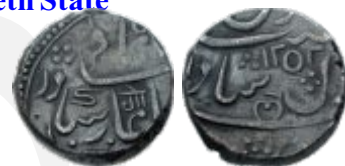
181 Dilshadabad mint, Silver, Rupee, in the name of Shah Alam II, AH 1252, Nagari Go on obv and Nagari La on rev (KM# C40). Extremely Fine.