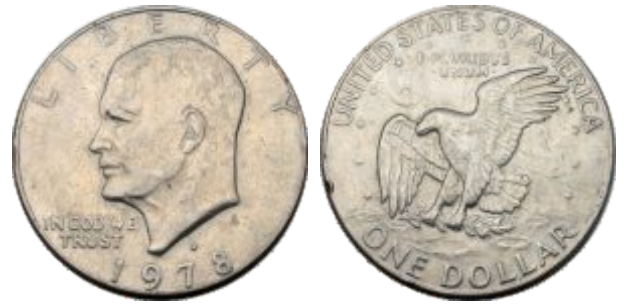
322 USA, Cupro-Nickel, Dollar, 1978, bust to left on obv, eagle on rev. Very Fine.