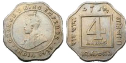
279 George V, Cupro-nickel, 4 Annas , Calcutta mint, 1919, no dot . Fine+.