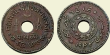
171 Vijayrajji, Copper, Paylo, with the name of George VI, VS 1999, AD 1943, Bhuj mint. Very Fine+ Estimate: ₹ 1-100