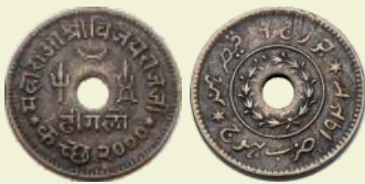
174 Vijayrajji, Copper, Dhinglo, with the name of George VI, VS 2000, AD 1943, Bhuj mint. Very Fine+ Estimate: ₹ 1-100