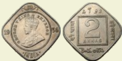
286 George V, Cupro-nickel, 2 Annas , Bombay mint, 1936 , dot . Almost UNC.