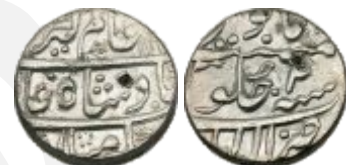
127 Alamgir II, Silver, Rupee, Allahabad mint, mint name at bottom on rev, RY 2. About Extremely Fine.