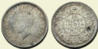
298 George IV, Silver, 1/4 Rupee , Bombay mint, 1940, dot, head type I . Extremely Fine, Rare.