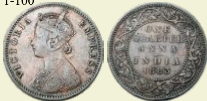
239 Victoria Empress, Copper, 1/4 Anna, Bombay mint, 1883, B/I . Very Fine. Scarce.