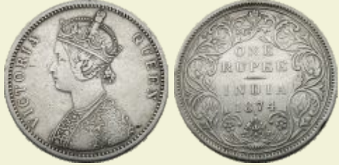
226 Victoria Queen, Silver, Rupee , Bombay mint, 1874, A2 / II / dot . Very Fine (cleaned). Rare.