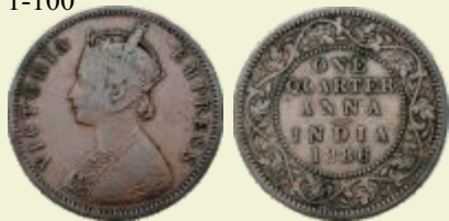
241 Victoria Empress, Copper, 1/4 Anna, Bombay mint, 1886, B/I . Very Fine. Scarce.