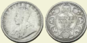
276 George V, Silver, \frac{1}{4} Rupee , Bombay mint, 1915, dot . About Very Fine, Scarce.