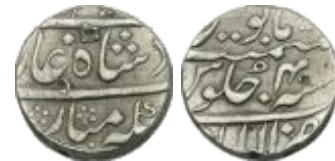
126 Alamgir II, Silver, Rupee, Allahabad mint, mint name at bottom on rev, RY 4. Very Fine+