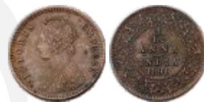
249 Victoria Empress, Copper, 1/12 Anna, Calcutta mint, 1891, bust B , Extremely Fine.