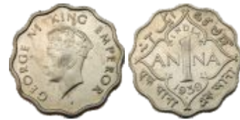
301 George VI, Cupro-nickel, 1 Anna , Bombay mint, 1939, dot, head type I , About Extremely Fine.