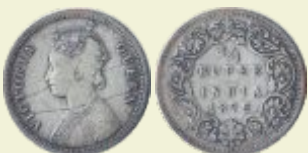
230 Victoria Queen, Silver, 2 Annas , Bombay mint, 1876, A / I . Scratches on obverse otherwise About Very Fine.