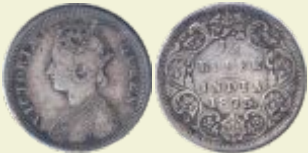
228 Victoria Queen, Silver, 2 Annas , Bombay mint, 1875, A / I . Very Fine (cleaned).