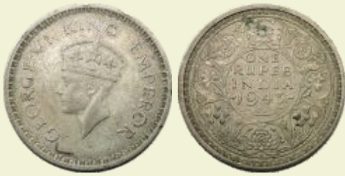
295 George VI, Silver, Rupee , Bombay mint, 1943, C / I (a) / diamond, Small '3' . Very Fine.