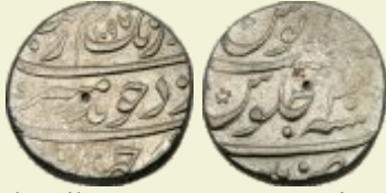
117 Aurangzeb, Silver, Rupee, Patna mint, mint name at bottom on rev, AH 1097, RY 30. Very Fine+.