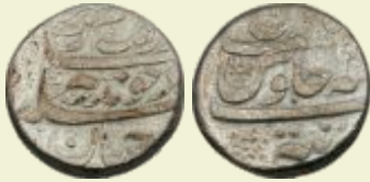
119 Aurangzeb, Silver, Rupee, Tatta (Nagarthatta in Sind) mint, complete mint name at bottom on rev, AH 1088, RY 3x. About Extremely Fine.