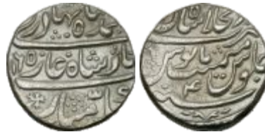
125 Ahmad Shah Bahadur, Silver, Rupee, Shahjahanabad Dar ul Khilfat mint, mint name at top on rev, AH 1165, RY 4. Extremely Fine+.