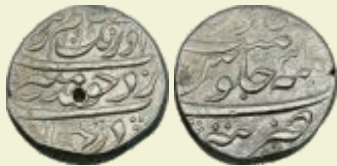
120 Aurangzeb, Silver, Rupee, Tatta (Nagarthatta in Sind) mint, complete mint name at bottom on rev, AH 1098, RY 31. About Extremely Fine.