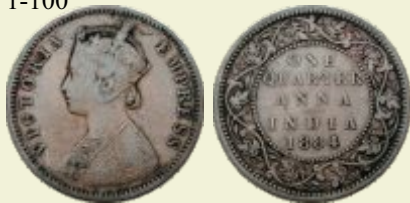
240 Victoria Empress, Copper, 1/4 Anna, Bombay mint, 1884, B/I . Very Fine. Scarce.