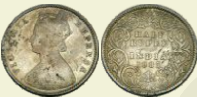
308 Victoria Empress, Silver, ½ Rupee, Calcutta mint, 1883, A/I/C incused (Pridmore# 267). About Very Fine, Rare.