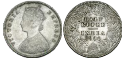
312 Victoria Empress, Silver, ½ Rupee, Calcutta mint, 1896, A/I/C incused (Pridmore# 279). About Extremely Fine, Scarce.