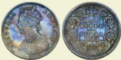
307 Victoria Empress, Silver, ½ Rupee, Calcutta mint, 1883, A/I/C incused (Pridmore# 267). Extremely Fine, Extremely Rare.