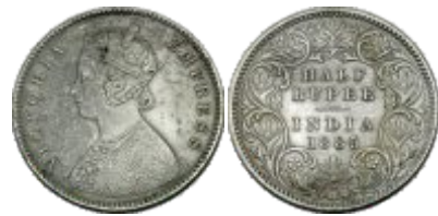
311 Victoria Empress, Silver, ½ Rupee, Calcutta mint, 1885, A/I/C incused (Pridmore# 269). Extremely Fine+ (cleaned), Rare.