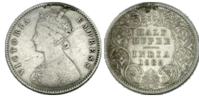
309 Victoria Empress, Silver, ½ Rupee, Calcutta mint, 1883, A/I/C incused (Pridmore# 267). About Very Fine, ex mount.