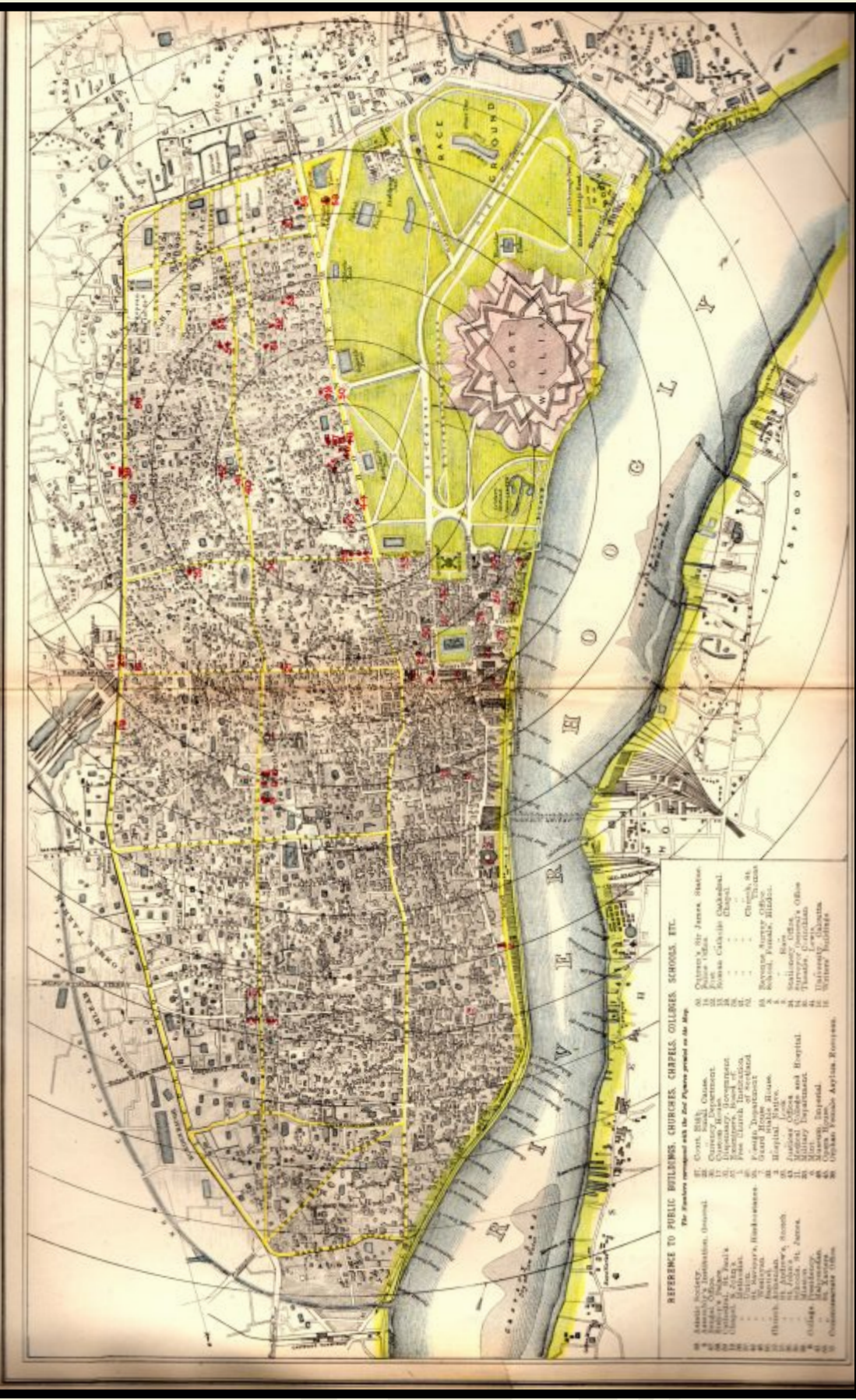
1883 Map of Calcutta, entitled - City plan of Calcutta, 42 x 28 cm, it's a still engraving print of Plan of the City of Calcutta from the Famous Lett's Popular Atlas printed in Lett's son and company Pvt. Ltd., London. Crack at the centre else Extremely Fine, Rare.