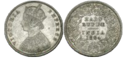
310 Victoria Empress, Silver, ½ Rupee, Calcutta mint, 1884, A/I/C incused (Pridmore# 268). Extremely Fine, Rare.