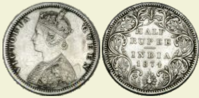
303 Victoria Queen, Silver, ½ Rupee, Bombay mint, 1874, B2/II/dot (Pridmore# 285). Very Fine+, Scarce.