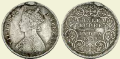
306 Victoria Empress, Silver, ½ Rupee, Calcutta mint, 1878, A/I/no mint mark (Pridmore# 262). About Very Fine, ex mount.