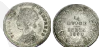
314 Victoria Empress, Silver, ¼ Rupee, Calcutta mint, 1879, C/II/C incused (Pridmore# 384). Very Fine, Rare.