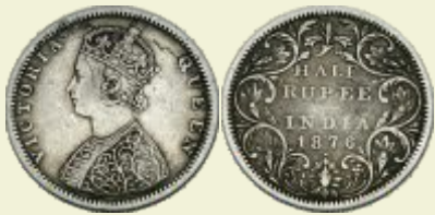
305 Victoria Queen, Silver, ½ Rupee, Bombay mint, 1876, B2/II/dot (Pridmore# 287). Very Fine, Scarce.