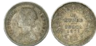
313 Victoria Empress, Silver, ¼ Rupee, Calcutta mint, 1879, C/II/C incused (Pridmore# 384). Very Fine+, Rare.