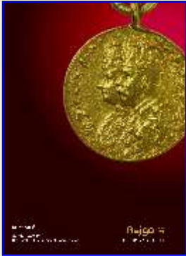
Auction 8 16/8/2013 Ahmedabad