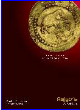
Auction 13 21/12/2013 Pune