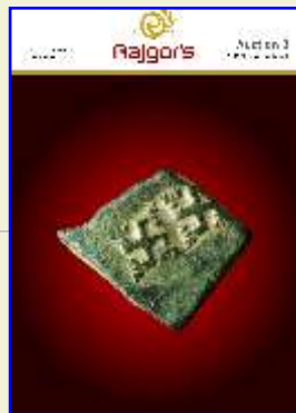
Auction 3 1/3/2013 Ahmedabad