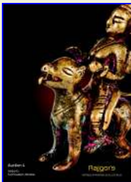
Auction 4 18/4/2013 Mumbai