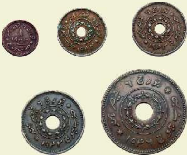
186 Vijayrajji, Copper (5), Complete set of 5 Denominations in copper, Adhiyo , VS 2002-AD 1946; Paylo , VS 1999-AD 1943, Dhabu , VS 1999-AD 1943, Dhinglo , VS 2000-AD 1943, and Trambiyo , VS 2000-AD 1943. All with the name of George VI, Bhuj mint. Very Fine+ and above, Scarce as a set of 5