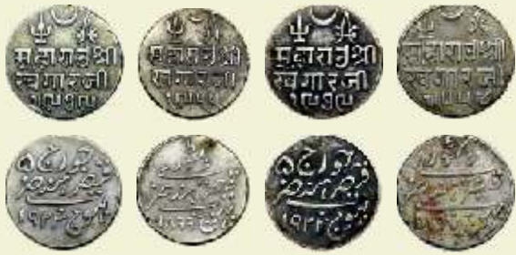
184 Khengarji III, Silver (4), Kori , Straight Lines type, with the name of Victoria Empress, VS 1954-AD 1987, VS 1955-AD 1899 ; with the name of George V, VS 1979-AD 1923 (2). About Extremely Fine, Scarce. 4 coins