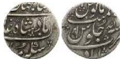
144 Ahmedabad mint, Silver, Ankushi Rupee , issued in the name of Mughal Emperor Shah Jahan III, mint name at bottom on rev, AH 117x, RY Ahad. About Extremely Fine, Rare . Estimate: ` 3,500-4,000.....