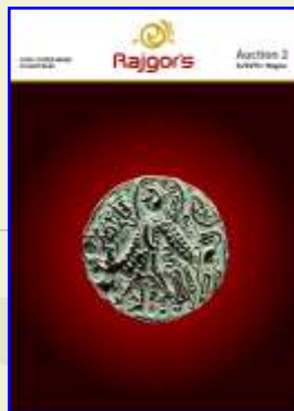
Auction 2 26/1/2013 Nagpur