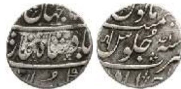
143 Ahmedabad mint, Silver, Ankushi Rupee , issued in the name of Mughal Emperor Shah Jahan III, mint name at bottom on rev, RY Ahad. About Extremely Fine, Rare . Estimate: ` 4,000-5,000.....