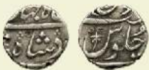
140 Shah Jahan III, Silver, 1/2 Rupee, Surat mint, mint off flan at bottom, a palm tree as a mint mark on rev. Very Fine, Rare . Estimate: ` 5,000-6,000.....