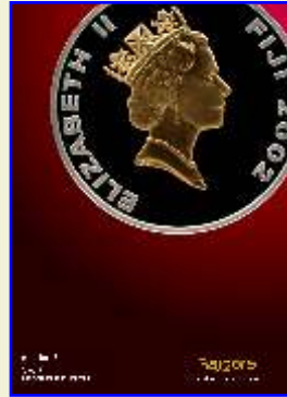
Auction 6 2/6/2013 Mumbai