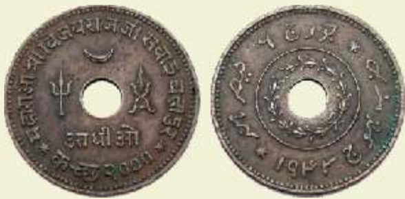
185 Vijayrajji, Copper, Adhiyo , with the name of George VI, VS 2000-AD 1943 , Bhuj mint. Very Fine+, Rare date.