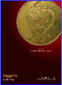
Auction 9 31/8/2013 Mumbai