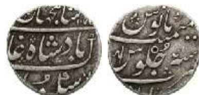
145 Ahmedabad mint, Silver, Ankushi Rupee , issued in the name of Mughal Emperor Shah Jahan III, mint name at bottom on rev, AH 1175, RY Ahad. Very Fine, Rare with full dates. Estimate: ` 8,000-9,000.....