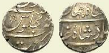
139 Shah Jahan III, Silver, Regular Rupee, Surat mint, mint name at bottom on rev, RY Ahad. Very Fine+ , Rare . Estimate: ` 5,000-6,000.....