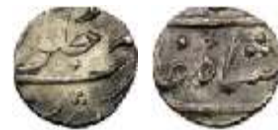
142 Shah Alam II, Silver, 1/4 Rupee, Surat mint, mint name at bottom on rev. Extremely Fine, Rare . Estimate: ` 8,000-10,000.....