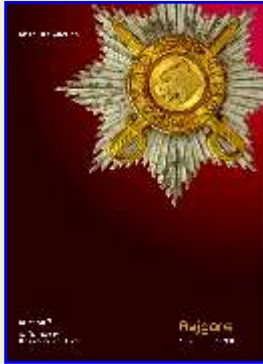
Auction 7 13/7/2013 Mumbai