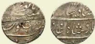
138 Shah Jahan III (AD 1759-1760, AH 1173-1174), Silver, Posthumous Rupee, Surat mint, AH 1180, RY Ahad. Posthumously minted during the reign of Shah Alam II but with the name of Shah Jahan III and not of Shah Alam II. A big chisel mark across the face on the rev indicates the mint cancellation. Interesting, unknown and Very Rare to appear like this. Estimate: ` 10,000-15,000.....