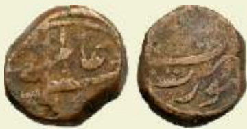
137 Alamgir II, Copper, Dam, Surat mint, complete mint name at bottom on rev. Fine+ , Scarce . Estimate: ` 500-1,000.....