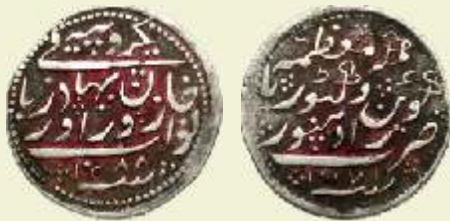
191 Zorawar Khan Babi , Silver, Rupee , with the name of Queen Victoria, AH 1288, AD 1871 , Radhanpur mint, milled edge (KM# 11). Extremely Fine+ for the weakly struck coins, Very Rare.