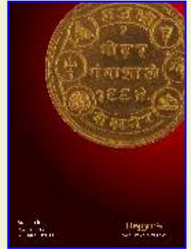
Auction 5 18/4/2013 Mumbai