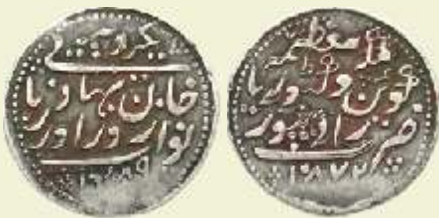
192 Zorawar Khan Babi , Silver, Rupee , with the name of Queen Victoria, AH 1289, AD 1872 , Radhanpur mint, milled edge (KM# 11). About Extremely Fine for the weakly struck coins, Very Rare.