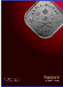
Auction 12 11/12/2013 Mumbai