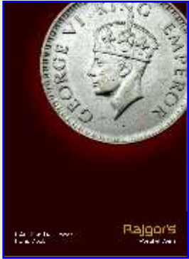
i-Auction 14 27/2/2014 Mumbai