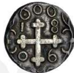
196 Diu, Maria I , Silver, 7.63 g, 300 Reis, 1806 , numerals of date in each corner of the Cross on obv, Crowned Shield on rev (KM# 51). Extremely Fine+, Very Rare in this high grade.