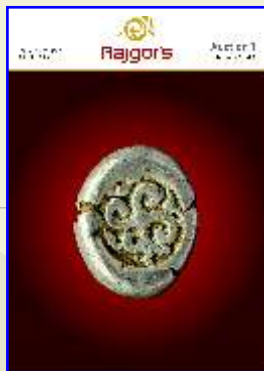
Auction 1 12/12/2012 Pune