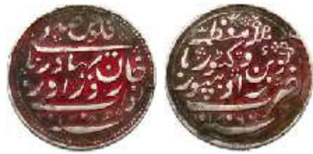
194 Zorawar Khan Babi , Silver, 100 Falus (1 Rupee) , with the name of Queen Victoria, AH 1286, AD 1869 , Radhanpur mint, milled edge (KM# 6). Extremely Fine for the weakly struck coinage, Very Rare.