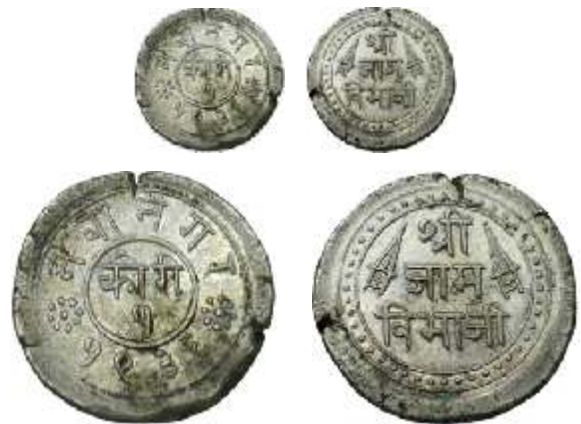
189 Jam Vibhaji, Silver, 1 Kori , in his own name, VS 1936 , Nawanagar / Kori 1 and 1936 on obv, Shri / Jam / Vibhaji within circular border on rev. Thin and broad Planchet due to excessive pressure from the hammer on the top, resulting thereby the spreading-out of the coin planchets in all the directions. About Extremely Fine and a good example of minting process.