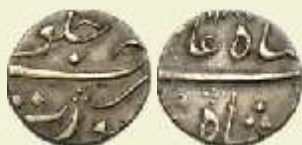
141 Shah Alam II , Silver, 1/2 Rupee, Surat mint, complete mint name at bottom on rev, AH 1180. About Extremely Fine, Rare with the AH date. Estimate: ` 5,000-6,000.....