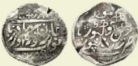
193 Zorawar Khan Babi , Silver, Rupee , with the name of Queen Victoria, AH 1289, AD 1872 , Radhanpur mint, milled edge (KM# 11). Fine+, Rare.