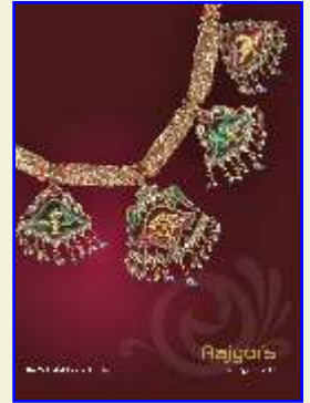
Auction 10 29/9/2013 Mumbai