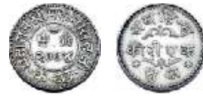
187 Madansinghji, Silver, Jai Hind Kori , VS 2004 (1948), with the salutation, Jai Hind (Hail India) to the newly independent Union of India, Bhuj mint. The last currency of the now erstwhile State of Kutch in Gujarat. Extremely Fine, Scarce.